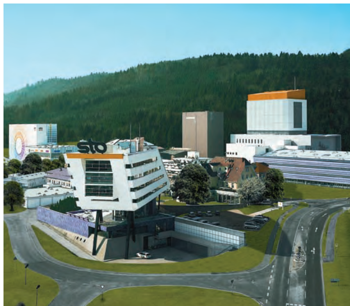
Sto Head office, Black Forest, Germany.

As the authorized partner of Sto for Australasia, Stoanz Ltd is committed to the Sto philosophy. Today having developed a full range of Sto plaster systems that have been tested and certified by BRANZ for the New Zealand market, Sto is recognized as a leader in the plaster facade and cladding market.