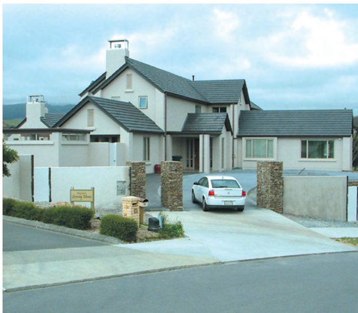
StoTherm plaster system.

International benchmark in the field of cladding and insulation systems.