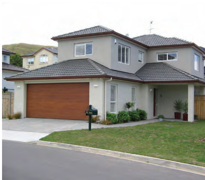
Sto on fibre cement sheet.

International benchmark in jointing, plaster and facade systems.