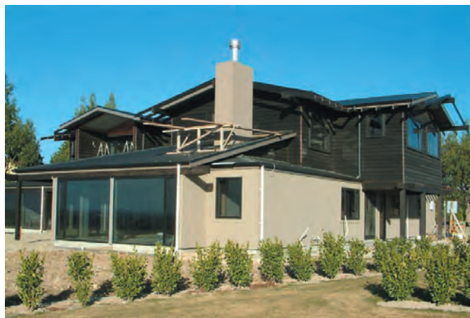
StoLite on a 4.5 mm fibre cement sheet.

By selecting the appropriate fibre cement sheet, the strength, bracing and acoustic properties of the exterior can be adjusted to meet the site conditions.