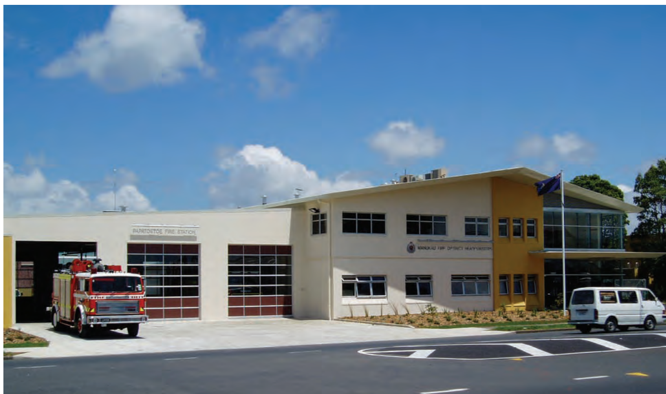
StoLite on a 7.5 mm fibre cement sheet.