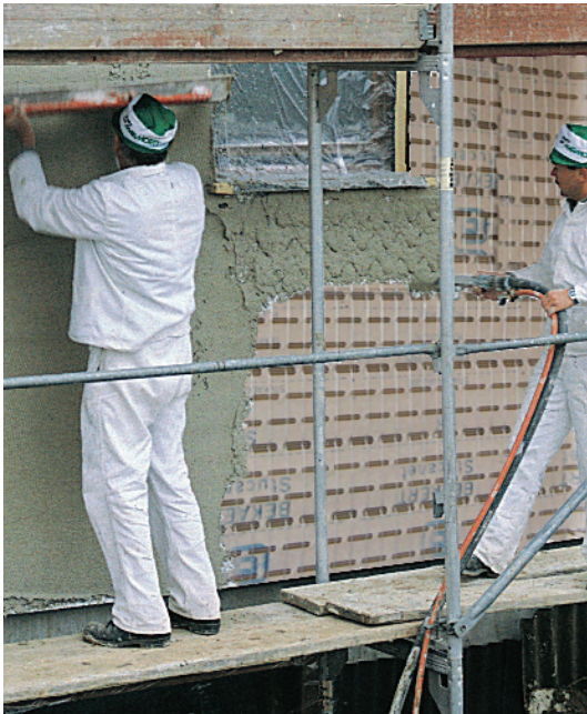
Mechanical application of Sto plaster using a PFT Ritmo mixing pump.