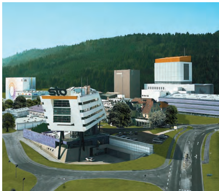
Head office Sto, Black Forrest, Germany.

As the authorized partner of Sto for Australasia, Stoanz Ltd is committed to the Sto philosophy. Today having developed a full range of Sto plaster systems that have been tested and certified by BRANZ for the New Zealand market, Sto is recognized as a leader in the plaster facade and cladding market.