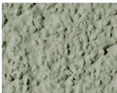
Stolit K 2.0 mm

Coloured self gauging float finishing renders.