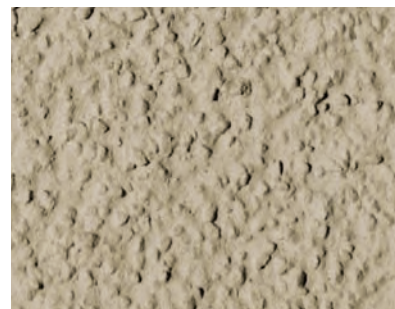
Stolit K 1.5 mm

Coloured self gauging float finishing renders.