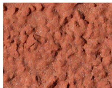
Stolit K 3.0 mm

Coloured self gauging float finishing renders.