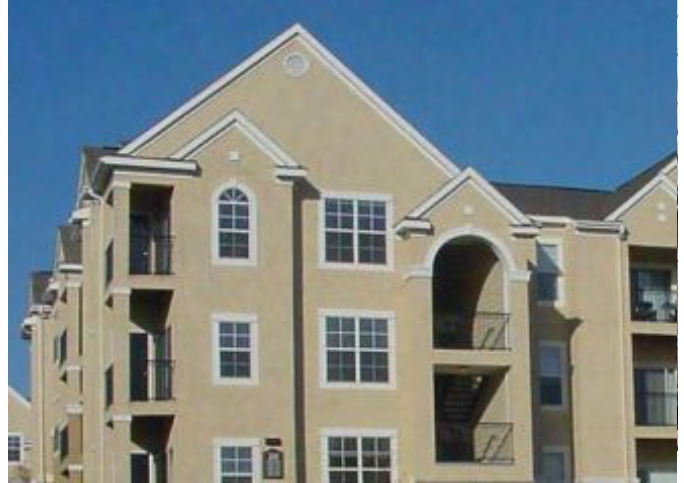
StoStucco System: stainless steel lath fixed on a timber frame construction.

Combining lightweight engineered mineral basecoat with technologically advanced fibre reinforcement plaster and elastomeric finishes, it creates a stucco cladding that is superior to the traditional, hand mixed applicator product.