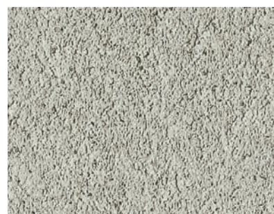
Stolit MP Natural

Coloured fine float, sponge or light adobe finishing render.