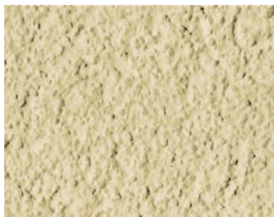
Stolit K 1.0 mm

Durable, strong, hardwearing, impact resistant, malleable, weather resistant, colour stable and highly resistant to micro-organisms. They are designed with good vapour permeability to allow the building to breathe while still repelling liquid water. All renders are easy to apply and can be tinted from the StoColor System or matched to the colour of your choice, using the Sto spectrometer.