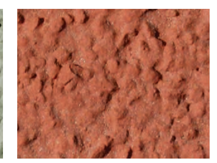
Stolit K 2.0 mm

Coloured self gauging float finishing renders.