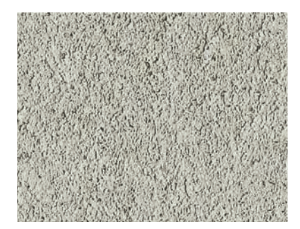
Stolit MP Natural

Coloured fine float, sponge or light adobe finishing render.