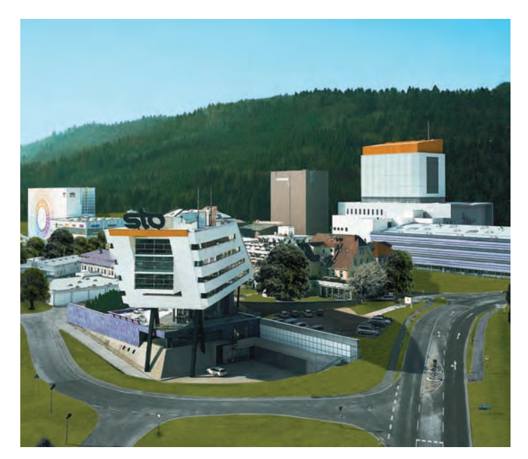
Sto Head office, Black Forest, Germany.

As the authorized partner of Sto for Australasia, Stoanz Ltd is committed to the Sto philosophy. Today having developed a full range of Sto plaster systems that have been tested and certified by BRANZ for the New Zealand market, Sto is recognized as a leader in the plaster facade and cladding market.