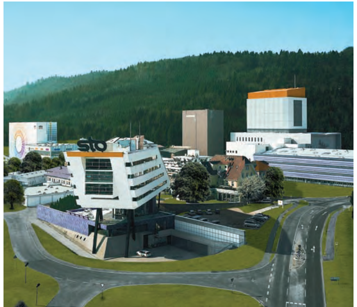
Head office Sto, Black Forrest, Germany.

As the authorized partner of Sto for Australasia, Stoanz Ltd is committed to the Sto philosophy. Today having developed a full range of Sto plaster systems that have been tested and certified by BRANZ for the New Zealand market, Sto is recognized as a leader in the plaster facade and cladding market.