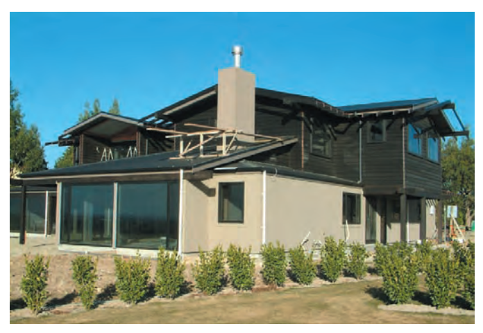
StoLite on a 4.5 mm fibre cement sheet.

By selecting the appropriate fibre cement sheet, the strength, bracing and acoustic properties of the exterior can be adjusted to meet the site conditions.