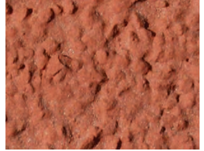
Stolit K 3.0 mm

Coloured self gauging float finishing renders.