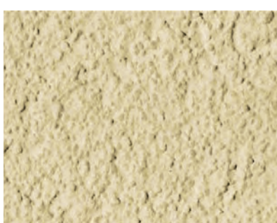
Stolit K 1.0 mm

The perfect combination of properties: Durable, strong, hardwearing, impact resistant, malleable, weather resistant, colour stable and highly resistant to micro-organism. They are designed with good vapour permeability to allow the building to breathe while still repelling liquid water. All renders are easy to apply and can be tinted from the StoColor System or matched to the colour of your choice, using the Sto spectrometer.