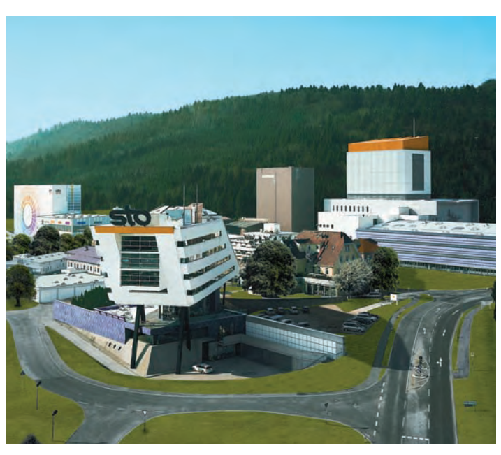
Head office Sto, Black Forrest, Germany.

As the authorized partner of Sto for Australasia, Stoanz Ltd is committed to the Sto philosophy. Today having developed a full range of Sto plaster systems that have been tested and certified by BRANZ for the New Zealand market, Sto is recognized as a leader in the plaster facade and cladding market.