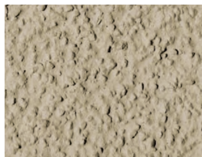
Stolit K 1.5 mm

Coloured self gauging float finishing renders.