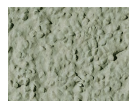
Stolit K 2.0 mm

Coloured self gauging float finishing renders.