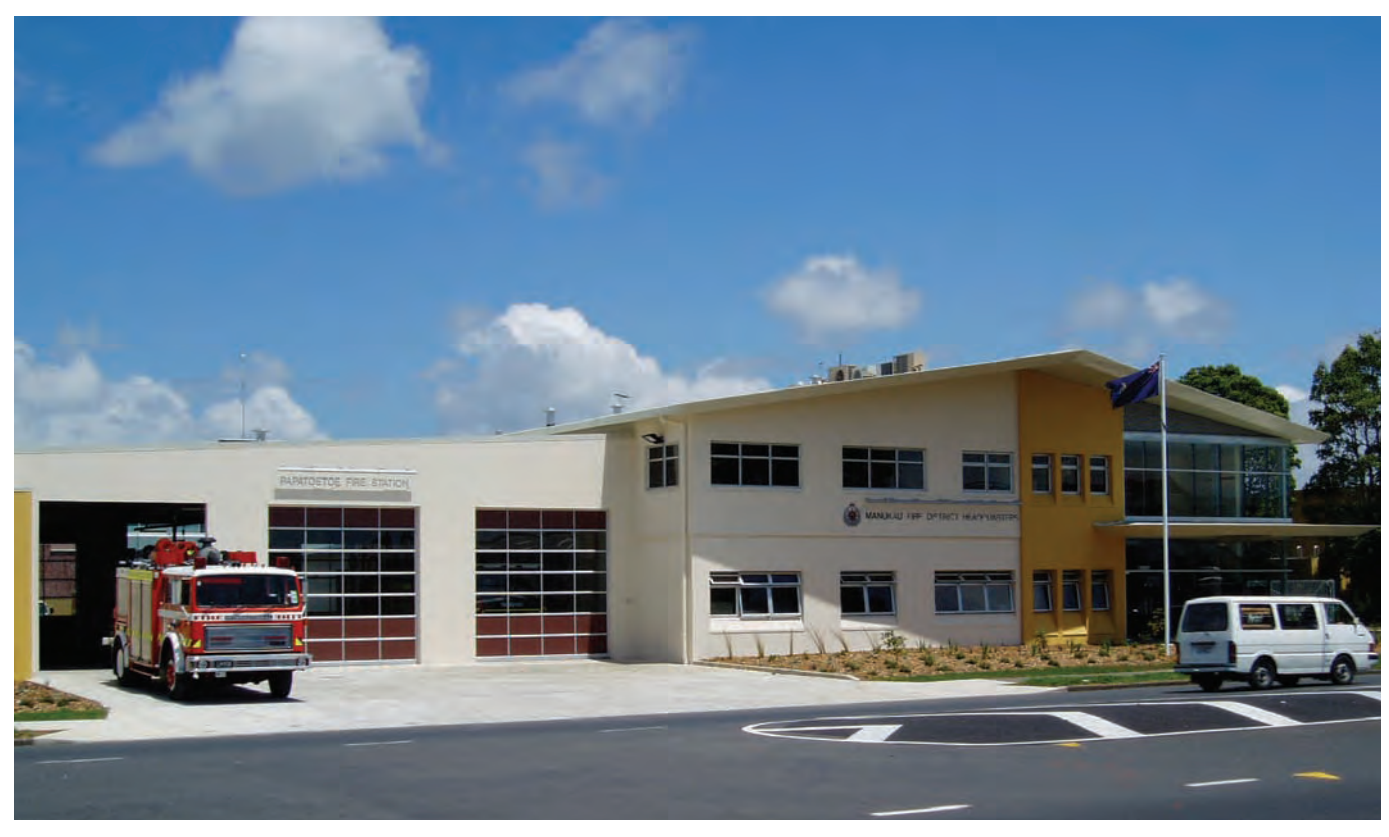
StoLite on a 7.5 mm fibre cement sheet.