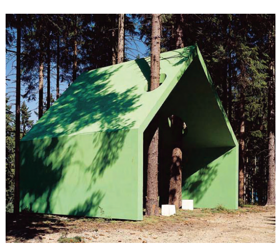
Sto with its environmental efforts is always a step ahead.

Sto products make a clear contribution towards improving the quality of the environment. External wall insulation cladding systems are extremely energy efficient, cutting heating requirements and preventing the release of CO<sup>2</sup> emissions. These systems contribute to the effort Sto is making towards active environmental protection through reducing air pollution, heating and energy to conserve the global climate.