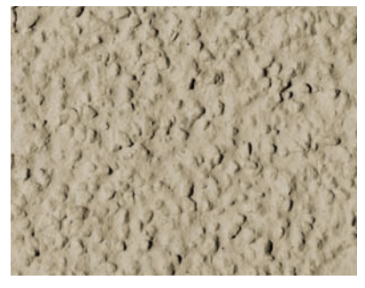
Stolit K 1.0 mm