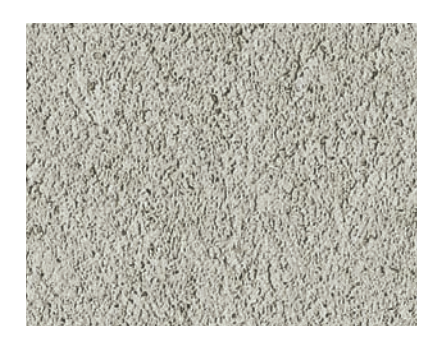
Stolit MP Natural

Coloured fine float, sponge or light adobe finishing render.