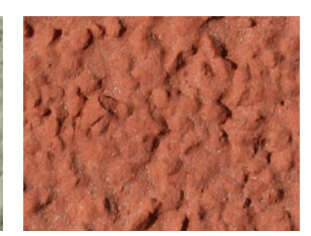
Stolit K 2.0 mm

Coloured self gauging float finishing renders.