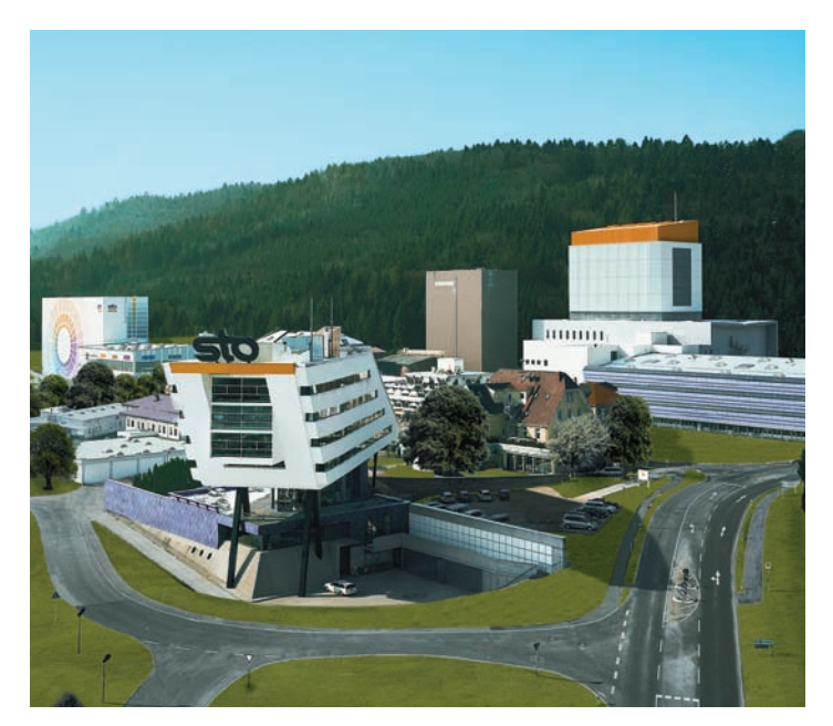
Head office Sto, Black Forrest, Germany.

As the authorized partner of Sto for Australasia, Stoanz Ltd is committed to the Sto philosophy. Today having developed a full range of Sto plaster systems that have been tested and certified by BRANZ for the New Zealand market, Sto is recognized as a leader in the plaster facade and cladding market.